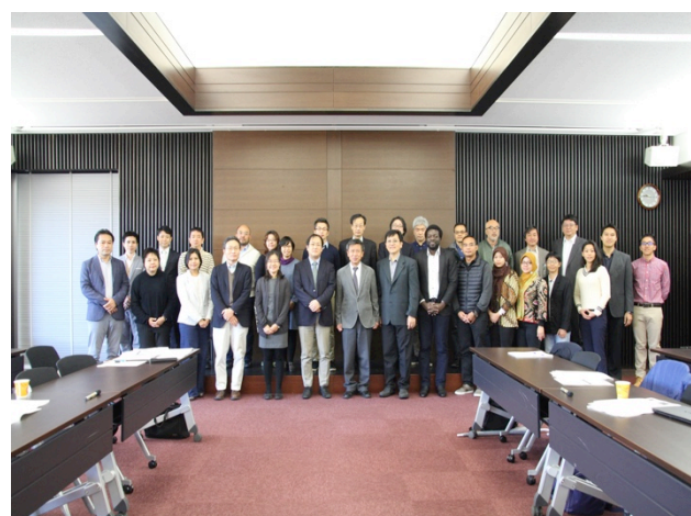
Fig 2. International Workshop The Japan-ASEAN Collaborative Research Program on Innovative Humanosphere in Southeast Asia